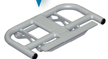
CSI-interface with quick-release system