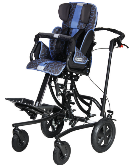
DURANGO with TOM5-seating system