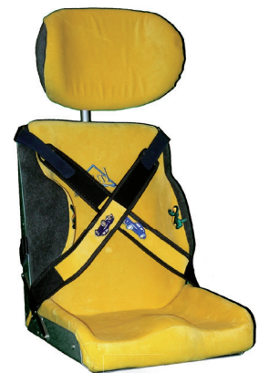
seat-shell (for seat-shell details contact your nearest seat-shell producer)