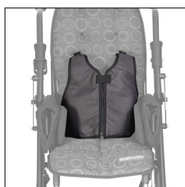
Immo. Waistcoat CLASSIC