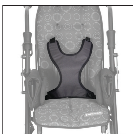
H-style harness CLASSIC