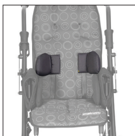
Side trunkrest CLASSIC