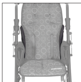
Hip rest CLASSIC