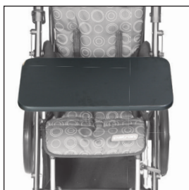
Work board BASIC - UNI