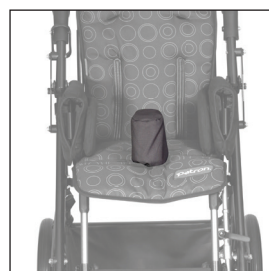
Abduction block CLASSIC