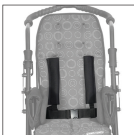
4-point immobilisation belt CLASSIC