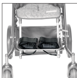
Feet fixation - pair